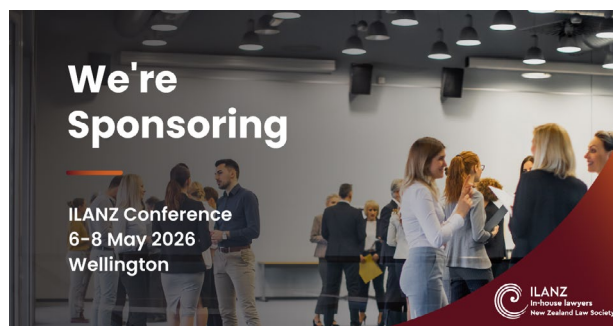
LinkedIn and Facebook